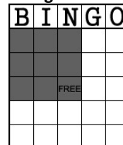
Block of Nine