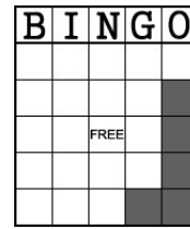
Any Direction Any Corner